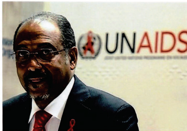
The Executive Director of the Joint (UNAIDS) Michel Sidibé