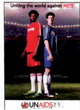
International Goodwill Ambassadors and football players, Michael Ballack and Emmanuel Adebayor, were the symbol of the “Give AIDS the Red Card” campaign in 2010.

2010 – The UNAIDS “Give AIDS the Red Card” campaign was launched at the South Africa FIFA World Cup with the objective to raise awareness and mobilize actions to strengthen the HIV response and accelerate progress in fighting HIV in Africa, particularly among young people.