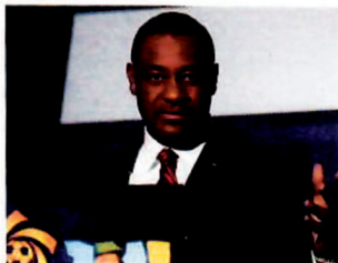
In October 2013, UNAIDS announced that Jeffrey Web, CONCACAF's president, would receive the "2013 UNAIDS Protect the Goal Special Award for the Diaspora".