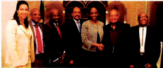
UNAIDS meets South African President, Jacob Zuma, and Aaron Motsoaledi, Minister of Health.