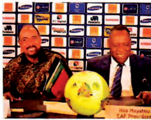
UNAIDS Executive Director, Michel Sidibé and the President of the Confederation of African Football, Issa Hayatou, signed a Memorandum of Understanding.