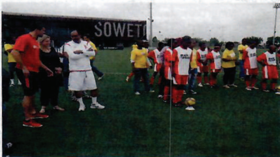
In January 2013, the UNAIDS Executive Director, Mr. Michel Sidibé, and Michael Ballack, UNAIDS International Goodwill Ambassador, visited a Nike training centre in Soweto, as part of a Grassroot Soccer project in South Africa.

The campaign was initiated during the 2010 FIFA World Cup in South Africa with the slogan "From Soweto to Bahia", creating a connection between these two regions. The communications campaign will also address subjects such as HIV prevention, testing and the need to offer ARV to 15 million people by 2015.