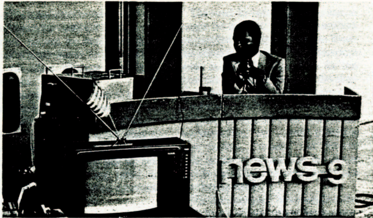
Liberian television: "While the telecommunications infrastructure is taken for granted in the West, in most African countries it is not adequate to sustain even essential services"