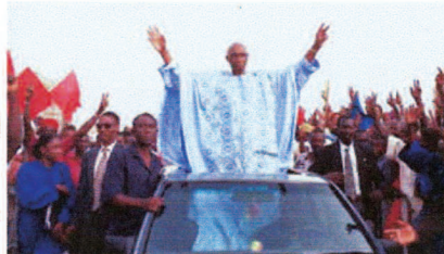
Wade on the campaign trail

Parliamentary elections held on April 29 in Senegal resulted in a landslide victory for the Sopi Coalition dominated by President Abdoulaye Wade's Senegalese Democratic Party (PDS). President Wade was elected in March 2000,