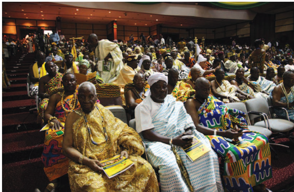
African mayors and mayors of African descent from more than 30 countries participating in a global conference in Accra, Ghana.