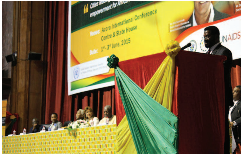
The Fourth World Summit of Mayors and Leaders from Africa and of African Descent was held from 1 to 3 June and was hosted by the Lord Mayor of Accra, Alfred Vanderpuije